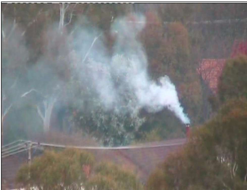
A wood heater in operation in Tuggeranong ACT