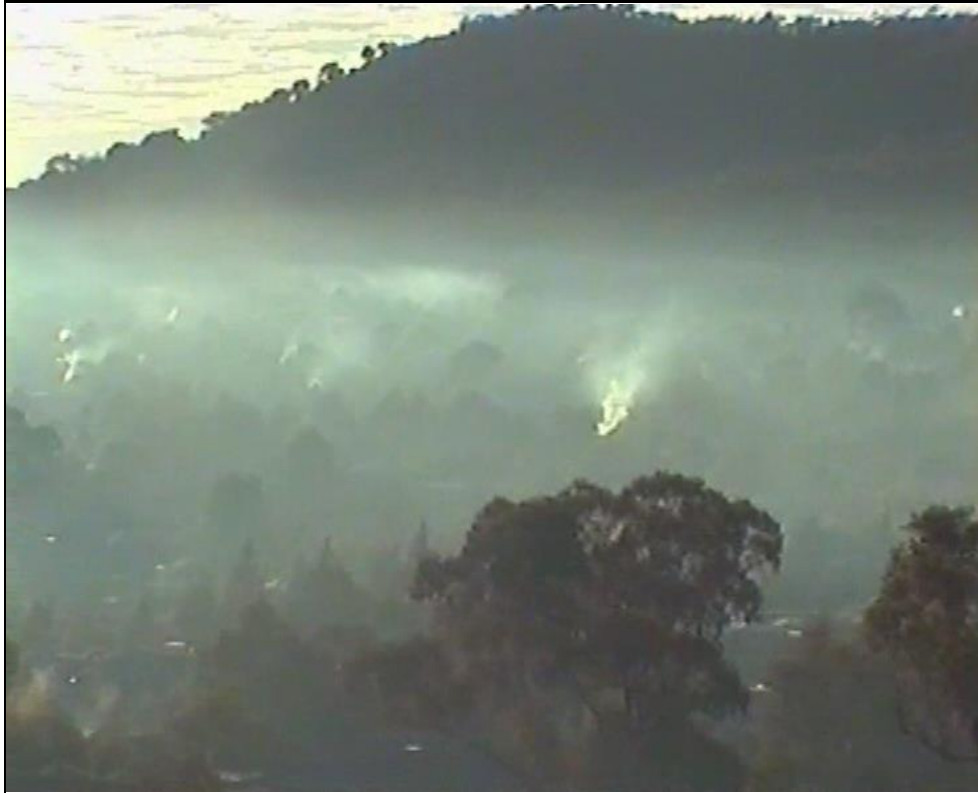
Wood smoke in the Tuggeranong Valley ACT